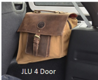
JLU 4 Door

Like your favorite pair of jeans, perfectly fitted fabric products may be a bit tight when they're new and like your jeans after a little use they'll stretch to that perfectly comfy fit you love so much. The initial fit of Saddlebag zipper strip is designed to be very tight for the same reason. When installing the strip to the Jeep tub, pull it tight to stretch it so the grommets line up with the holes in the tub/hardtop. This is normal and will ensure a good fit over time.