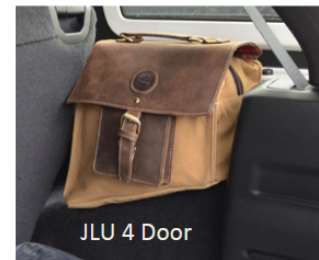
JLU 4 Door

Like your favorite pair of jeans, perfectly fitted fabric products may be a bit tight when they're new and like your jeans after a little use they'll stretch to that perfectly comfy fit you love so much. The initial fit of Saddlebag zipper strip is designed to be very tight for the same reason. When installing the strip to the Jeep tub, pull it tight to stretch it so the grommets line up with the holes in the tub/hardtop. This is normal and will ensure a good fit over time.